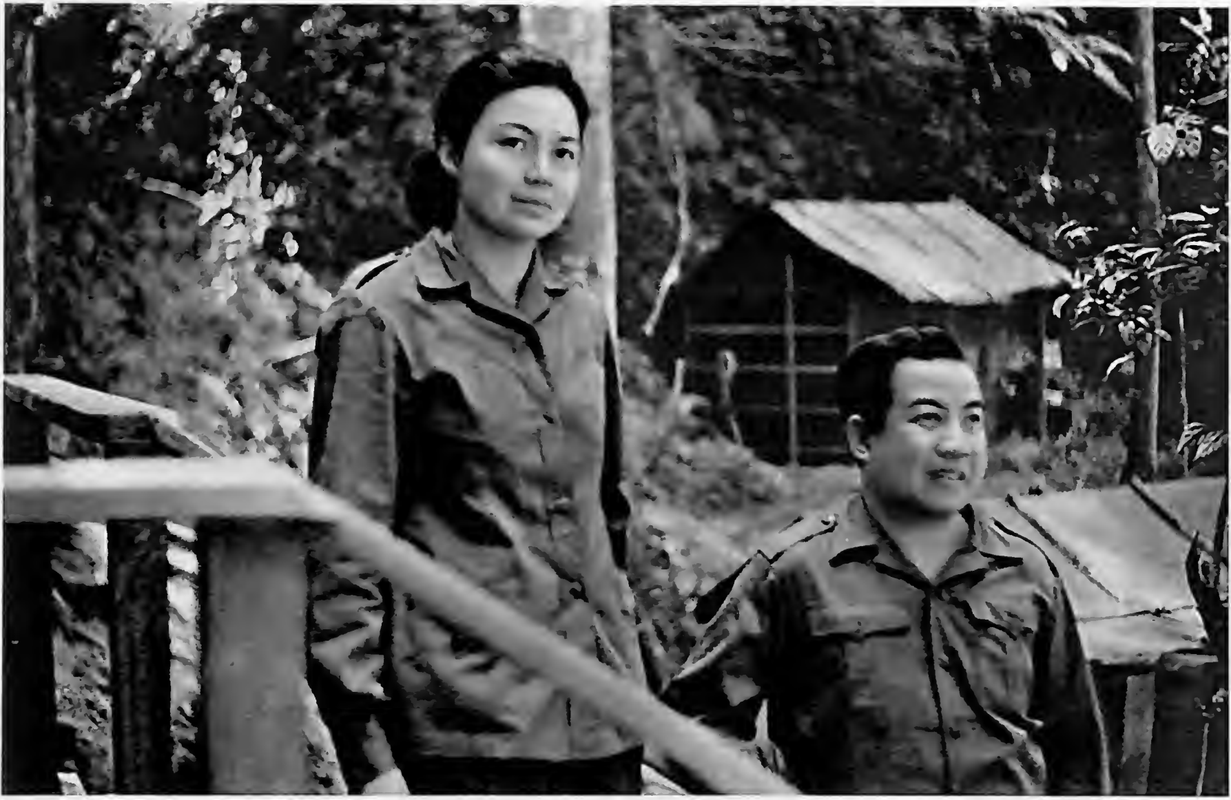
Resting somewhere in the Truong Son Range.